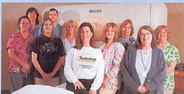
The Diagnostic Imaging team at Phoenixville Hospital's Outpatient and Surgery Center includes registered technologists with advanced board certifications for specialty modalities. Services include Mammography, CatScan, MRI, Ultrasound, Dexascan, and general X-Ray.

Serving patients from Chester County, Berks County, Montgomery County and beyond, the Cancer Center at Phoenixville Hospital offers a multidisciplinary approach to providing treatment protocols for most types of cancer and blood-related disorders. Phoenixville Hospital became a member of the Penn Cancer Network in 1991, and the hospital's outpatient Cancer Center opened in April 1992. The Cancer Center at Phoenixville Hospital provides the latest cancer treatments as well as access to an extensive base of sub-specialists for consultations and referrals, as necessary.