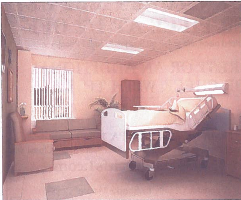
Pictured above is a composite image of the North Tower lobby renovations. Pictured at bottom left is a rendering of one of Phoenixville Hospital's new private post-partum rooms.