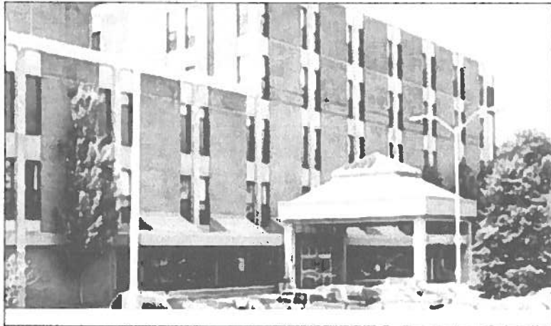
Phoenixville Hospital is now in Phase II of a $90 million expansion project, which includes reconfiguring and expanding the Women's Health Pavilion, renovating the North Tower lobby and adding a physicians' lounge to the hospital.

Spotlighting the changing needs of their patients, the hospital has followed through on facility enhancements. Phoenixville hospital is now in Phase II of a $90 million expansion project, which includes reconfiguring and expanding the Women's Health Pavilion, renovating the North